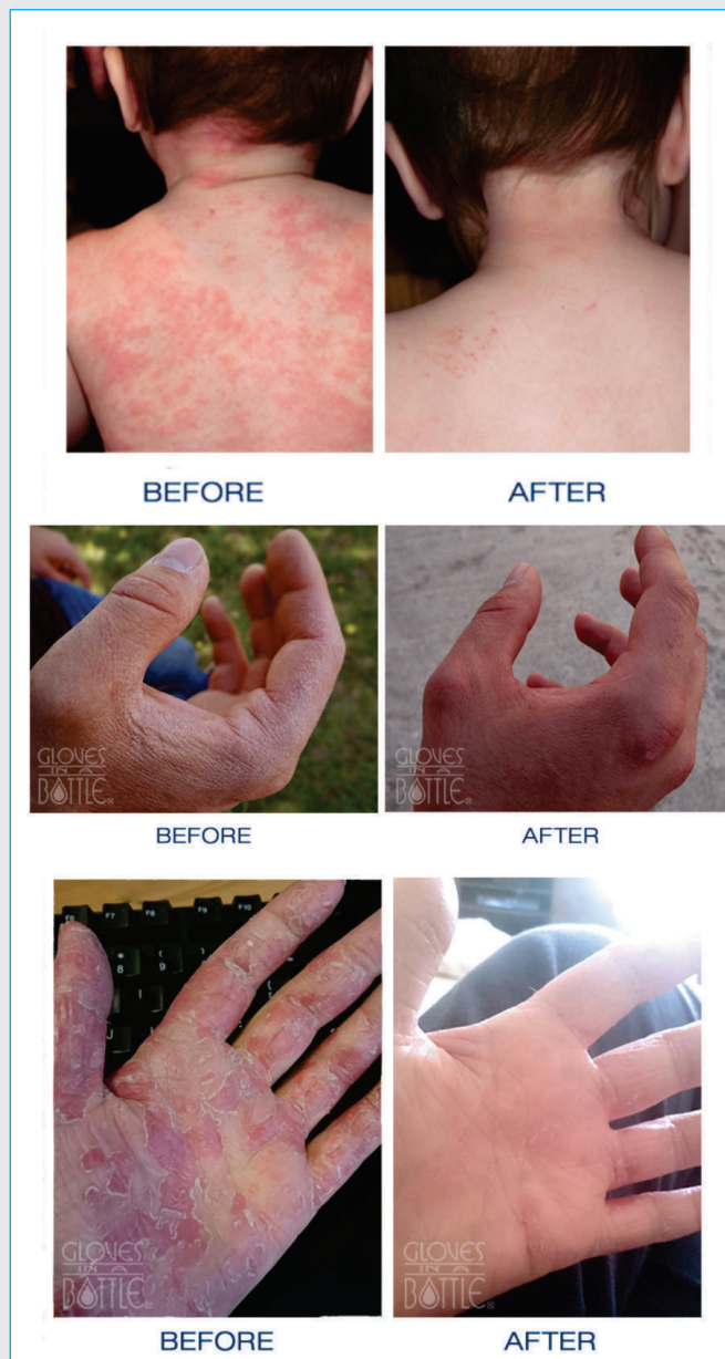
Images of actual results achieved when using Gloves In A Bottle .